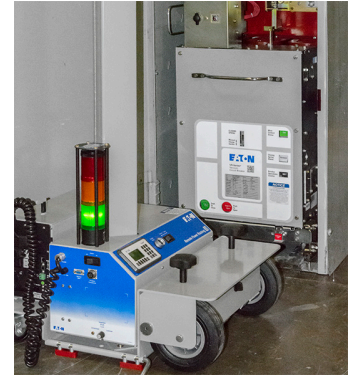
Rack VHC+ to connected position manually or with an RPR-2