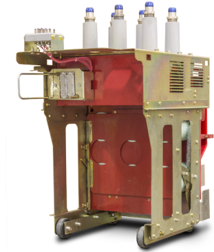
Vertical Cell Structure Adapter (Front View)