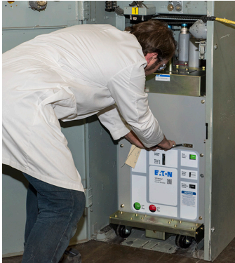
Lower and remove the existing vertical lift circuit breaker