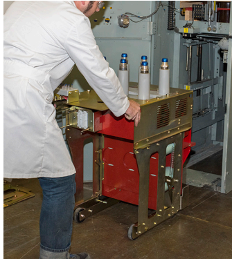
Insert the vertical structure adapter, lift into position and secure with provided hardware