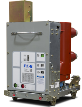
VHC-36+ Horizontal Draw-out Circuit Breaker