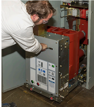
Insert horizontal draw-out VHC+ circuit breaker into adapter