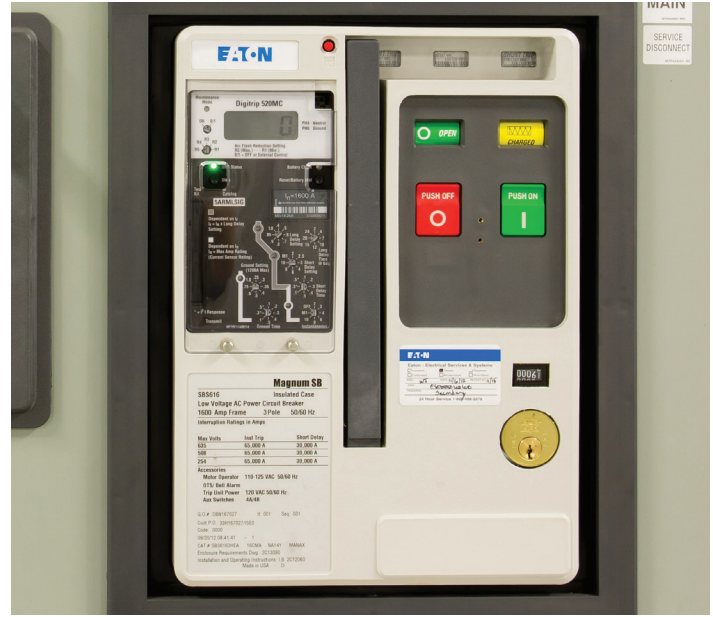
Eaton Magnum DS® power circuit breakers are used for protection and isolation of the inverter blocks. Eaton low voltage power circuit breaker incorporated at the Salem Power Center.