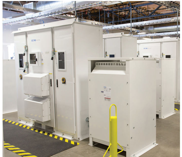
New Salem Smart Power Center incorporates Eaton's industry-leading storage inverter solutions.