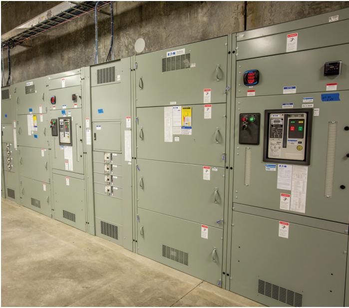
Eaton low voltage switchboards at the Salem Smart Power Center, part of Portland General Electric's Pacific Northwest Smart Grid Demonstration Project.