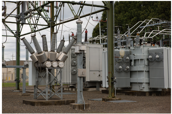
Transmission and distribution equipment in the Oxford substation near the Salem Smart Power Center.