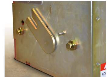
New Cell Coding System