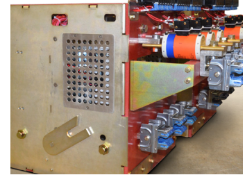
Heavy-Duty Steel Construction