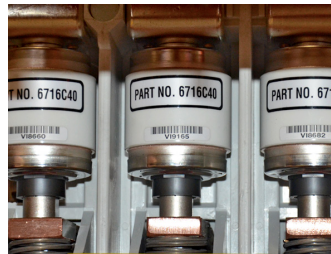
Reliable EATON Vacuum Technology