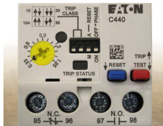
Solid State Overload Relay