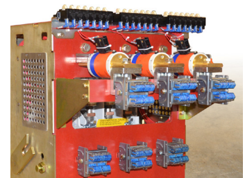
All New Power Conductors