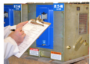
Quality is Designed-In

Each LV-VSR is designed and manufactured in a facility that is ISO 9001:2000 certified.