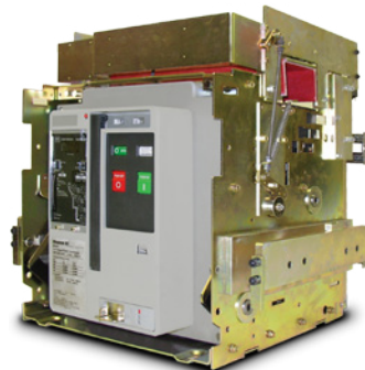
AR-Series Replacement Breaker