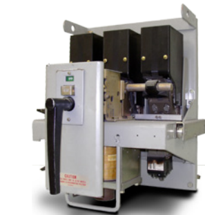
Original Magnetic Circuit Breaker

Rotary racking allows insertion and removal with the RPR-2 Remote Power Racking System.