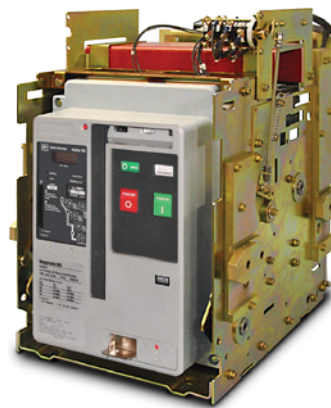
AR-Series Replacement Breaker