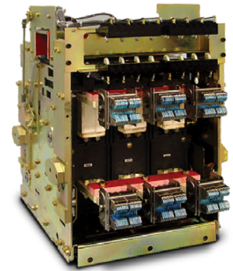
AR-Series Rear View

Eaton Corporation Electrical Sector 1111 Superior Avenue Cleveland, OH 44114 USA Eaton.com