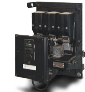
Original Magnetic Circuit Breaker

Rotary racking allows insertion and removal with the RPR-2 Remote Power Racking System.