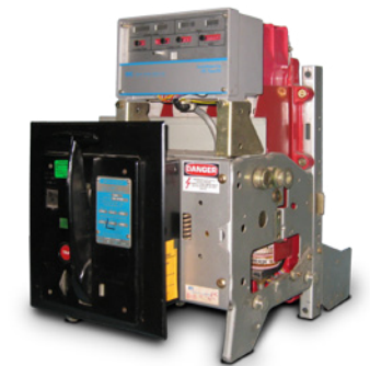
Original Magnetic Circuit Breaker

Rotary racking allows insertion and removal with the RPR-2 Remote Power Racking System.