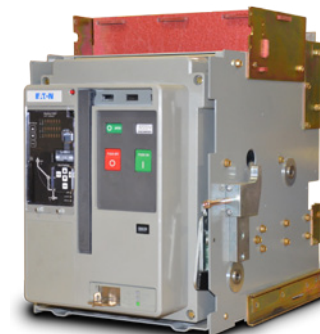
AR-Series Replacement Breaker