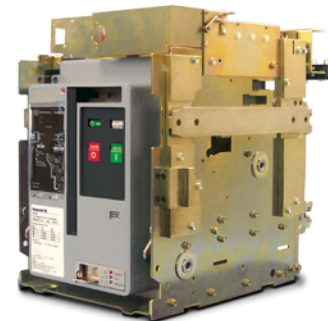
AR-Series Replacement Breaker