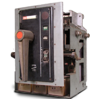
Original Magnetic Circuit Breaker

Rotary racking allows insertion and removal with the RPR-2 Remote Power Racking System.