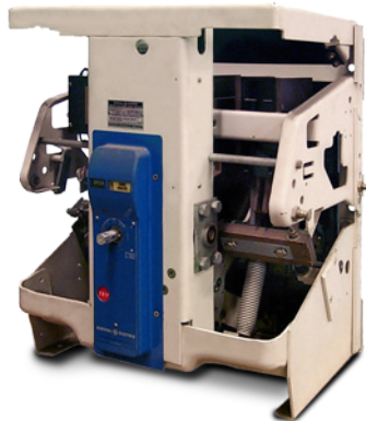
Original Magnetic Circuit Breaker

Rotary racking allows insertion and removal with the RPR-2 Remote Power Racking System.