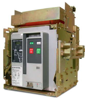
AR-Series Replacement Breaker (AK-2A-50-AR Shown)