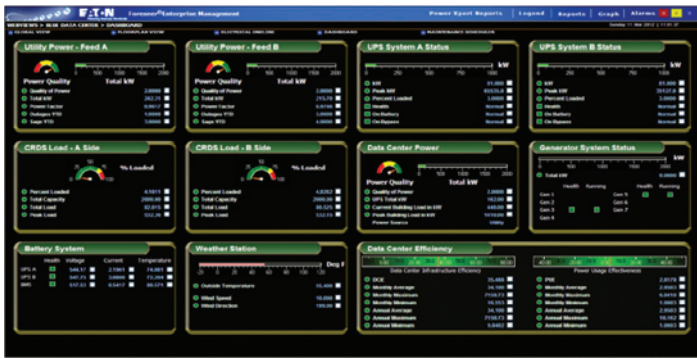
Key metrics are selected and displayed on a single dashboard.

"Foreseer gives us the ability to proactively and predictively detect changes before service is compromised, thus ensuring optimal data center health. With Project BlueGrass' flexible, modular, and scalable design, Eaton has created new data centers capable of supporting its business over the next 20 years."