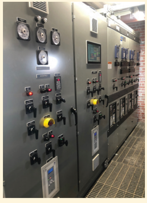
Control system interface