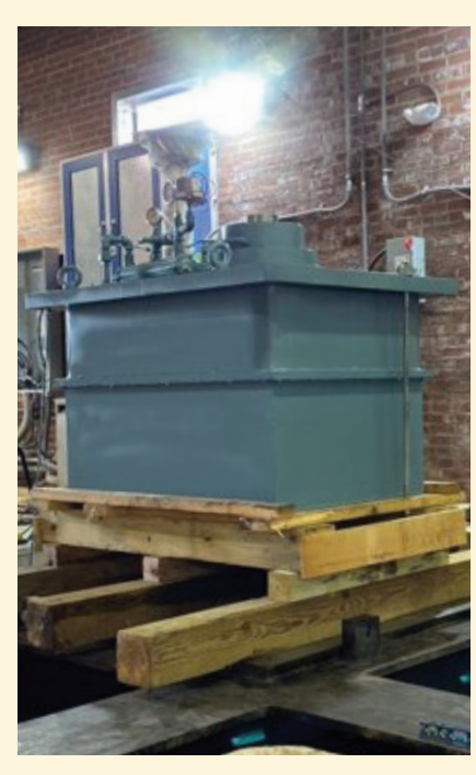
Gear box ready for install