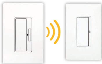
Anyplace switch with RF switch