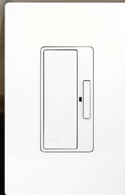
Anyplace switch Decorator series Includes screwless wallplate