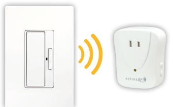
Anyplace switch with RF module

Combination kits available in decorator (shown) and designer series. Anyplace switch includes screwless wallplate.