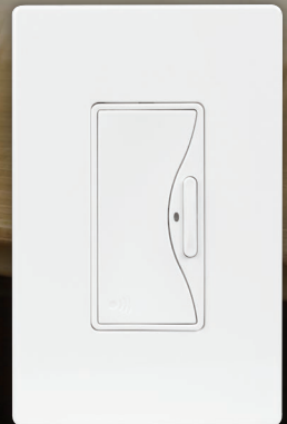
Anyplace switch Designer series Includes screwless wallplate