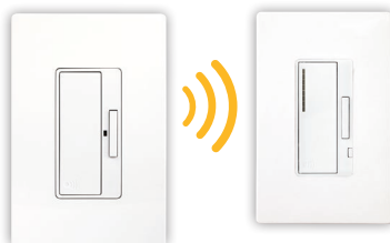
Anyplace switch with RF dimmer