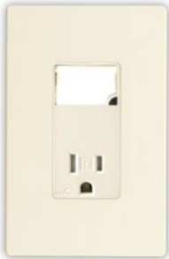
TR7735LA PJS26LA Wallplate