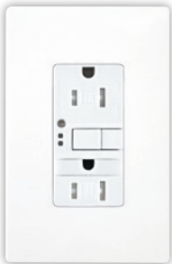
TRSGFNL15W PJS26W Wallplate