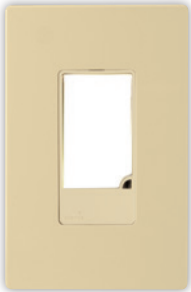
7737V PJS26V Wallplate