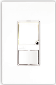
7738W PJS26W Wallplate