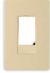
7737V PJS26V Wallplate