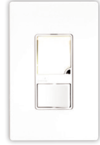
7738W PJS26W Wallplate