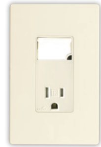
TR7735LA PJS26LA Wallplate