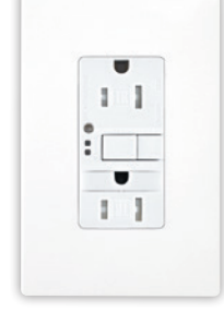
TRSGFNL15W PJS26W Wallplate