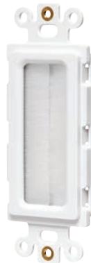
Table 1. Multimedia brush insert