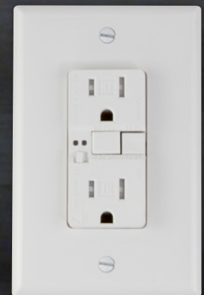
GFCI receptacle with audible alarm