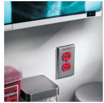
Emergency power areas must be identified as such with distinct marking or color on wallplate or device