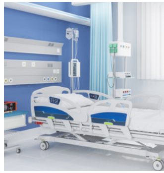
Patient beds in critical care spaces (other than operating rooms) must have a minimum of 14 hospital grade receptacle outlets, single or duplex.