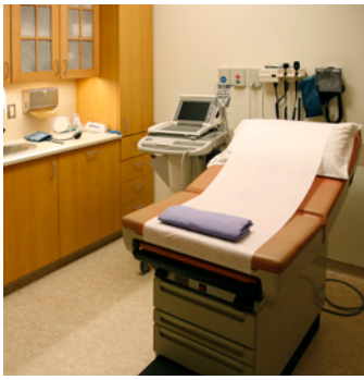
Patient beds in general care locations require a minimum of eight hospital grade receptacle outlets, single or duplex