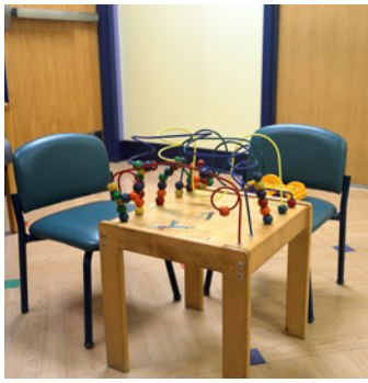
Receptacles in pediatric wards need to be tamper resistant