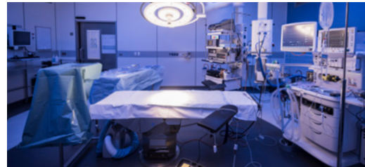
All receptacles and fixed equipment need ground-fault circuit-interrupter (GFCI) protection

Arrow Hart's rich line of hospital grade straight blade receptacles meet and exceed the demanding requirements of UL 498 and Federal Specification WC-596, providing consistent connectivity when uptime is critical. Unique to Arrow Hart, our exclusive 5-leaf contact design provides superior long-term plug retention for these crucial applications.