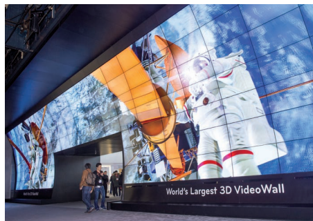
LED Walls and Video Displays (indoor and outdoor)