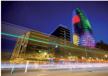
Architectural lighting (Graze & Cove)

SOURIAU is a leading provider of interconnect solutions designed to meet UL and international LED and luminaire safety standards. We are a unique company that offers flexibility, a collaborative approach and a strong commitment to meeting our customers design, engineering and manufacturing needs when bringing new products to market. For these reasons, SOURIAU has been the chosen interconnect provider for a variety of customers leading the market with innovative lighting products servicing a diversity of applications.