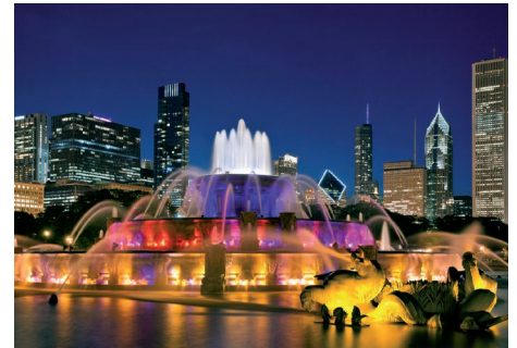
Water and Wet Design (Fountains, Pools and Waterparks)