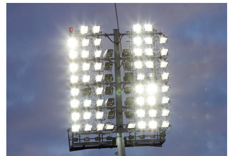
Stadium / Street Road lighting