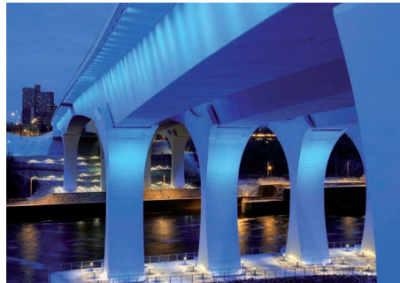
Bridge / Road Infrastructure lighting