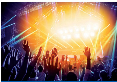
Stage and Entertainment lighting