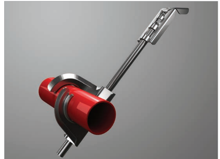
Figure 4. UL listed Seismic Brace Structural Attachment

Eaton 1000 Eaton Boulevard Cleveland, OH 44122 United States Eaton.com