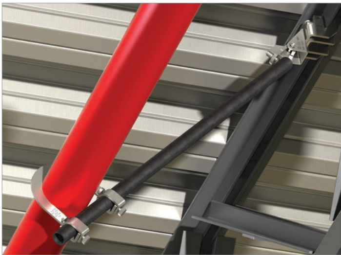
Figure 2. UL listed Sway Brace Assembly

Generally, these UL listed "Restraint" products should not be used to brace main or cross main piping. They should only be used as branch line restraints as their listing indicates. Recent changes to the UL test procedure have resulted in many manufacturers having products there were previously listed as a "Sway Brace" to fall into the new category of "Restraint." This can create a problem when contractors install products that were previously UL listed as a lateral brace, but now are only listed as a restraint. If these products are installed for a purpose for which they are not listed, it is the same as installing a non-listed product. AHJ's should be aware of the latest UL listings during both the plan review and inspection processes.