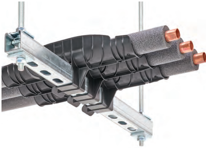
Snap 'N Shield pipe support strut trapeze application