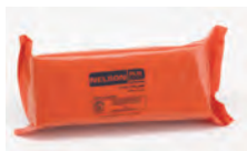
FSP-1043 Fire Stop Pillow 3" thick, 4" wide, 9.6" long (orange bag)