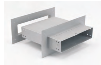
'U' Type Wall Sleeve WS (Wall Sleeve) Shown Sleeve is 20" long