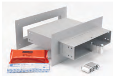
'D' Type Fire Wall Sleeve FWS (Fire Wall Sleeve) Shown Sleeve is 20" long