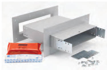
'CT' Type Fire Wall Sleeve FWS (Fire Wall Sleeve) Shown Sleeve is 20" long