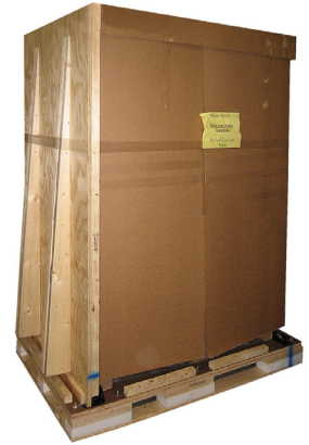
Completed HD Packaging. Ramp sold separately.