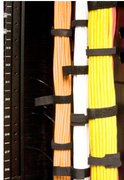
Easily manage large cable bundles without violating the EIA 19" standard.