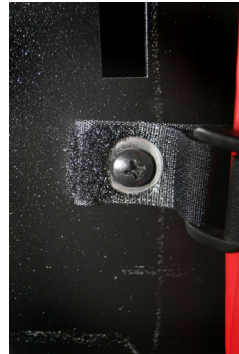
Velcro Buckle Straps can be used to secure cables by using self-tapping screws in the small round holes.