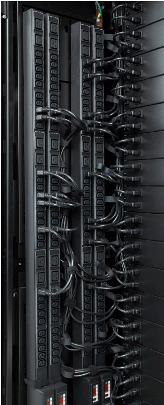
The lacing bar can hold up to four power strips using the tool-less button hole pattern.