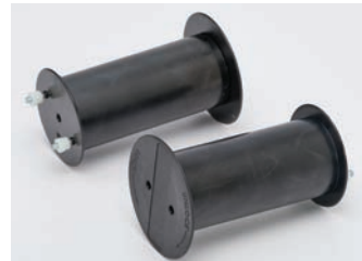
Telescopic Cable Spools