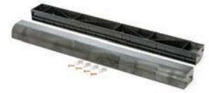
HDDODFB Rack Drop-Outs and Runway Mounting Brackets