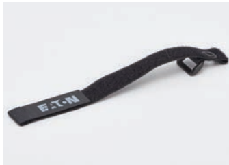
Eaton™ Velcro Strap