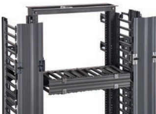
RCM+ Vertical and Horizontal Cable Managers