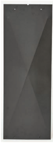
HDSP7BFB End-of-Row Side Panels