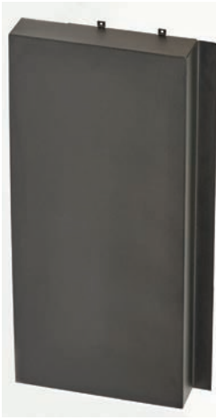
HDAB7BFB Low-Profile Air Baffles