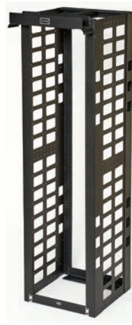
HD2T7BFB Cable Management Racks