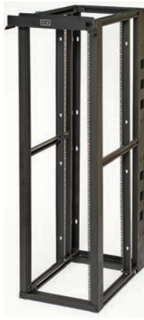
HD4S7DFB Four Post Adjustable Racks