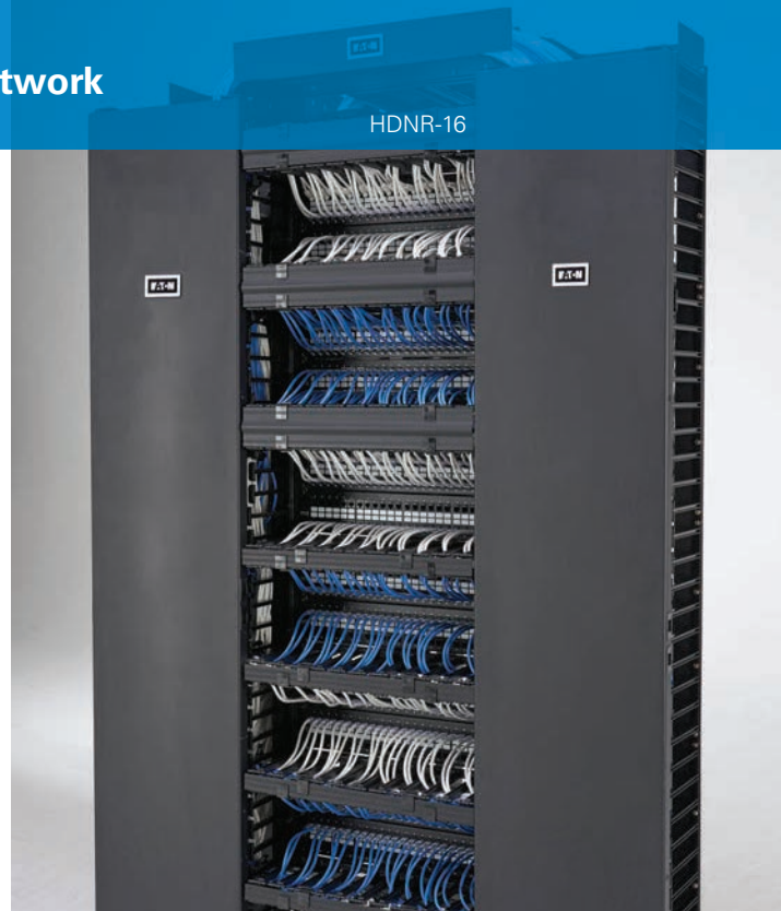
HDNR Cable Management Rack with High Capacity Cable Managers