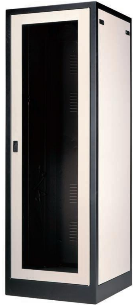
Mounting Rails Usable "U" space chart 1U = 1.75" (44mm)