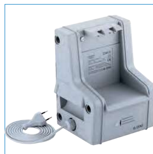
Charging unit Z 345.3