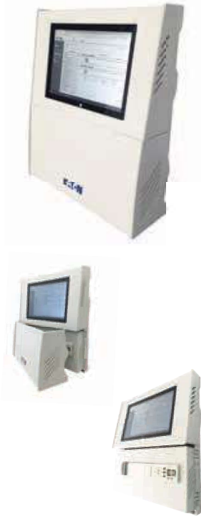
CGLine+ Touchscreen Controller