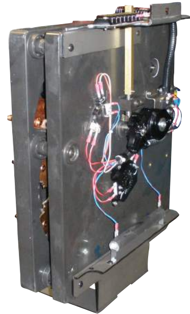
Figure 6. QD-3 Quik-Drive tap changer.

Quik-Drive load tap-changers meet IEEE® and IEC standards for mechanical, electrical and thermal performance.