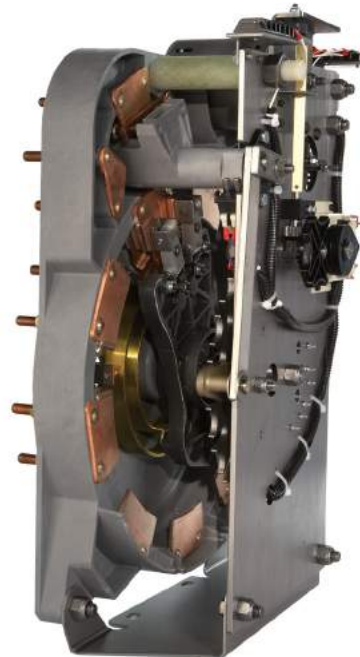
Figure 7. QD-5 Quik-Drive tap changer.