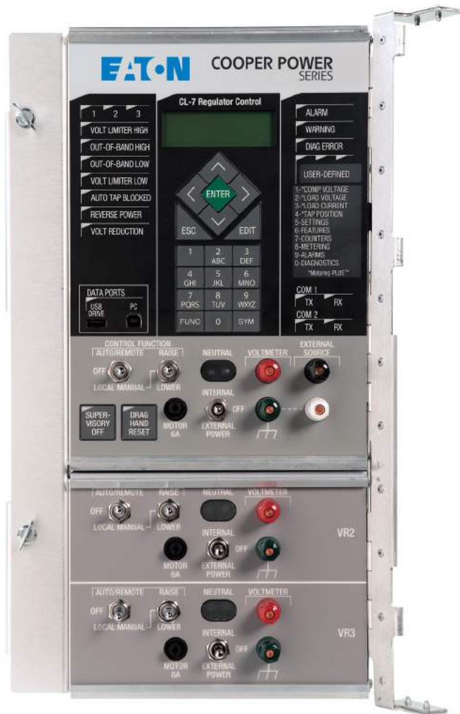
Figure 4. CL-7 multi-phase regulator control.