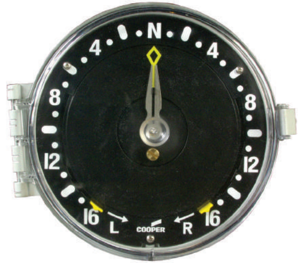
Figure 3. Position Indicator.

The five possible load current ratings associated with the reduced regulation ranges are summarized in Table 2 and Table 3 . At each setting, a detent stop provides positive adjustment. Settings other than those with stops are not recommended. The raise and lower limits need not be the same value, except for locations where reverse power flow is possible.