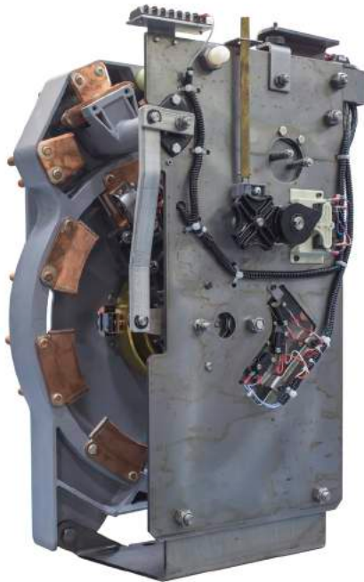
Figure 5. QD-8 Quik-Drive tap-changer.