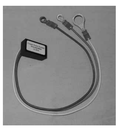
Figure 1. CT protector with red, green and white wires

ISO 9001 Certified Quality Management System