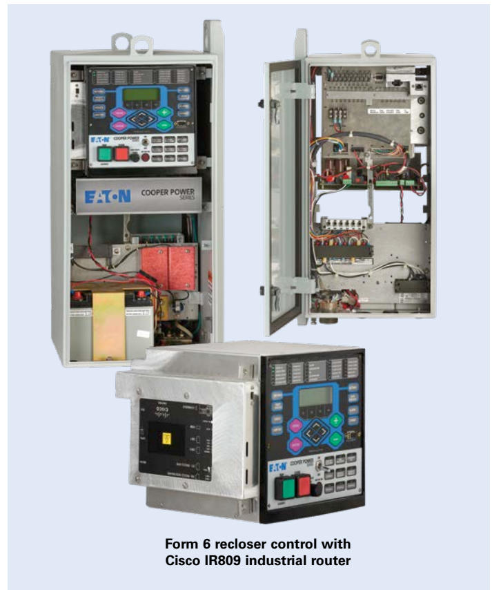
Form 6 recloser control with Cisco IR809 industrial router

Eaton 1000 Eaton Boulevard Cleveland, OH 44122 United States Eaton.com