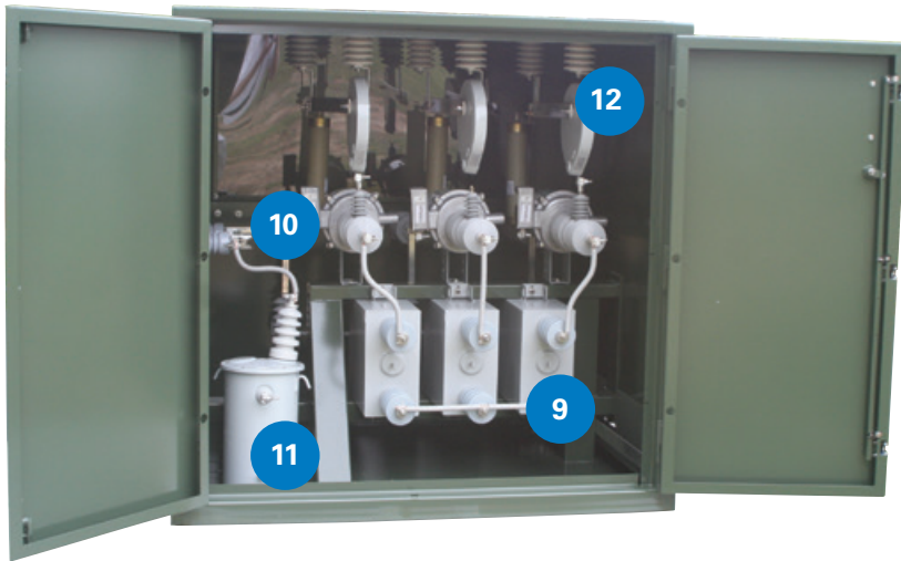
Equipment Rear Section