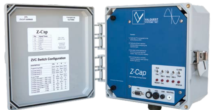
Valquest Z-Cap

Contact factory for more information regarding ZVC applications.