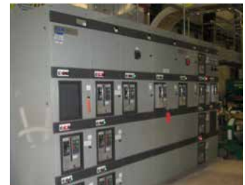
Magnum DS low voltage switchgear