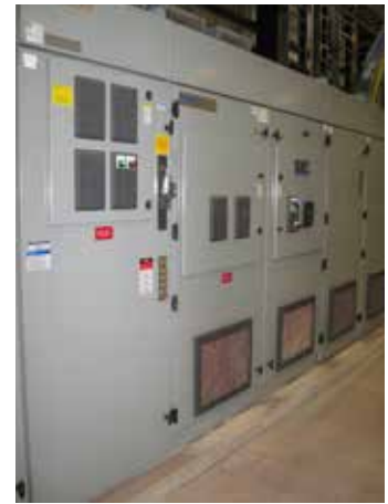
SC9000 EP drives