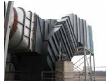
Process fan for one SC9000 EP drive