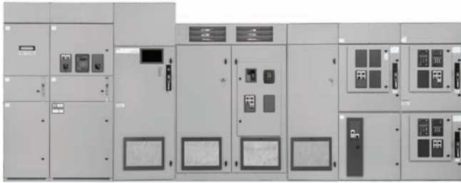
AMPGARD Motor Control Assembly with Main Breaker, SC 9000 AFD, RVSS and Two-High FVNR