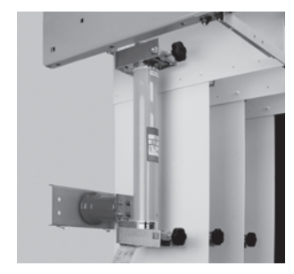
MVS-C Fuse Mounting

Fuse mountings: Complete three-phase fuse mounting assemblies or fuse live parts are available that are fully compatible with MVS-C switches. The fuse mountings are intended for use with Eaton's fuses.