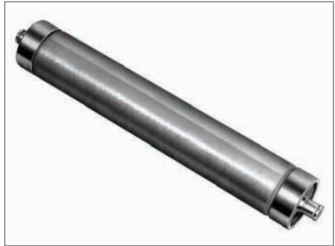
Figure 1. ELSP Current-Limiting backup fuse.

This two-part system provides low current protection with the replaceable expulsion fuse or resettable MagneX Interrupter, and it adds the energylimiting protection of a current-limiting fuse. Together, they coordinate easily with upstream and downstream devices.