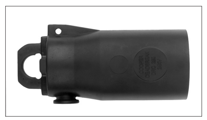
Figure 1. DRC250 Receptacle cap.

Note: This cap can only be installed or removed when the equipment is de-energised.