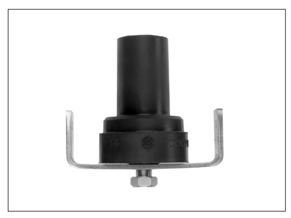
Figure 1. DPE250 Earthing plug

Note: This cap can only be installed or removed when the equipment is de-energised.