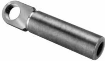
Figure 4. Compression Connector.

Compression connectors are available in all aluminum or friction welded coppertop designs, aluminum with unthreaded holes, and coppertop with either threaded or unthreaded holes. See Tables 3 and 4 for proper application. All connectors have aluminum crimp barrels and are designed for use with either aluminum or copper conductors.