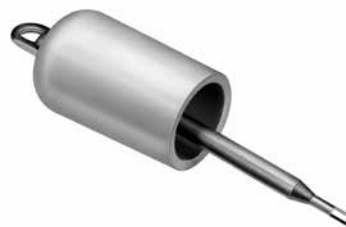
Figure 11. Catalog Number OT635

The installation torque tool is required to ensure proper torque when installing a 35 kV Class bushing adapter to a 600 A bushing interface. It is precision calibrated and hotstick operable.