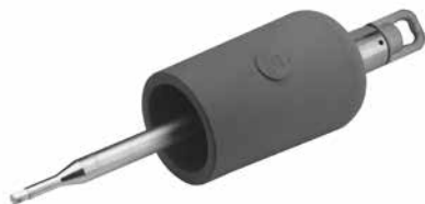
Figure 9. Catalog Number OTTQ635

To order 600 A, 35 kV Class deadbreak tools accessories, refer to Table 7.