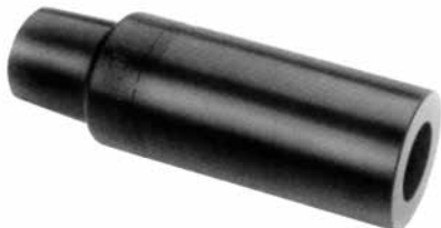
Figure 6. Cable adapter.

The molded cable adapter is available in sizes to fit cables from 0.875" to 2.36" in diameter (22.2 to 49.9 mm). Molded of high quality peroxide EPDM cured insulation and semiconductive rubber to provide stress relief for terminated cable. Refer to Table 6.