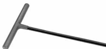
Figure 12. Catalog Number TWRENCH

The operating and testing tool is used with a hotstick to test for circuit de-energization and to install and remove a 35 kV Class LRTP equipped connector from an apparatus tap. The standard tool is equipped with a molded EPDM rubber cap to ensure tool seating.