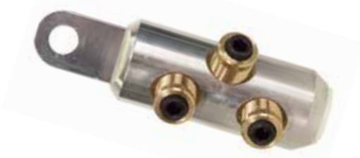
Figure 5. Shear bolt connector.

Bolted cable lug is fitted with stepless bolts, which shear off when optimum contact force has been reached. Provides electrical continuity for copper and aluminum conductors while eliminating need for dies and compression tools. Available in unthreaded aluminum for Eaton's Cooper Power series BOL-T™ and BT-TAP™ connector applications only. See Table 5.