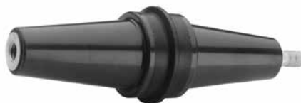
Figure 3. Connecting plug shown with stud.