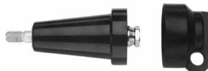
Figure 2. Insulating Plug with EPDM rubber cap.

Insulating Plug, available at 200 kV BIL