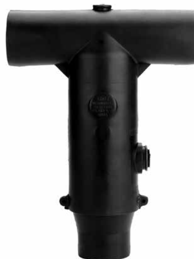
Figure 7. Molded rubber T-body.