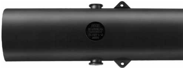
Figure 1. 600 A bushing extender unit (35 kV shown)

These instructions cannot cover all details or variations in the equipment, procedures, or process described nor provide directions for meeting every possible contingency during installation, operation, or maintenance. For additional information, contact your representative.