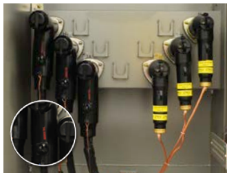
Red stamp indicating 200 kV BIL rating is color coordinated with the 200 kV BIL bushing.