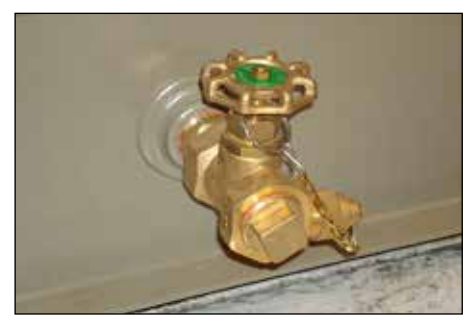
Figure 3. Drain valve with sampler.

· Laser-scribed anodized aluminum nameplate