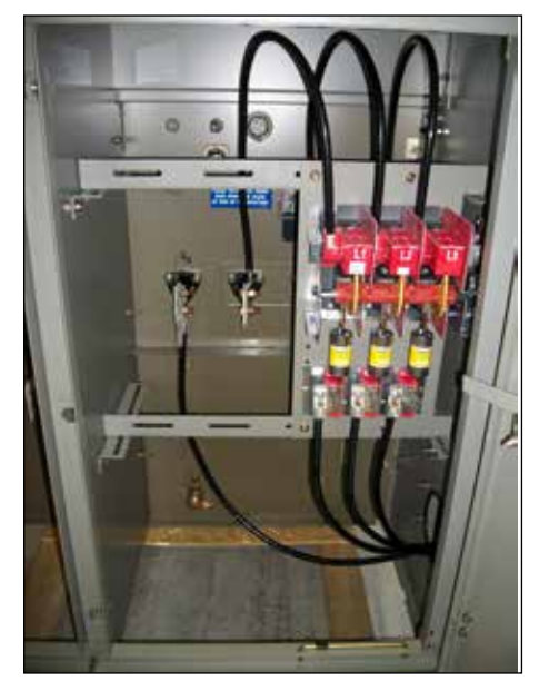
Figure 9. Modular transformer.

An MTU utilizes existing utility infrastructure, therefore eliminating the need to engineer and construct a dedicated communication network.