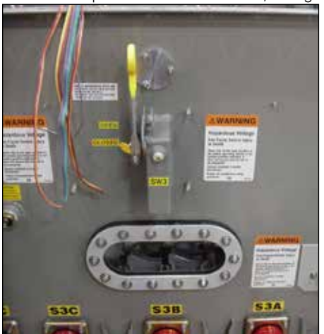
Figure 8. VFI transformer with visible break.

With a fire point of 360 °C, Envirotemp™ FR3™ fluid is FM Approved® and Underwriters Laboratories (UL®) Classified "Less-Flammable" per NEC® Article 450-23, fitting the definition of a Listed