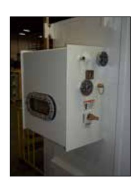
Figure 7. External visible break with gauges.