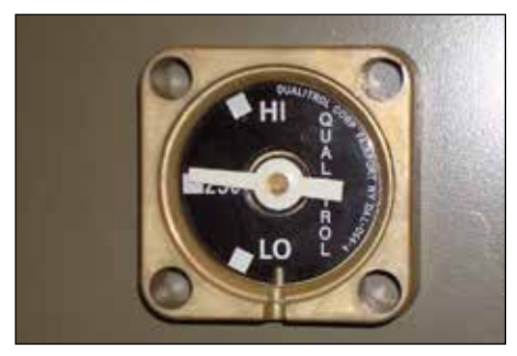
Figure 5. Liquid level gauge.