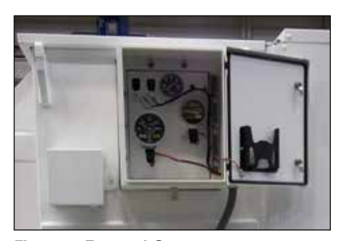
Figure 6. External Gauges.