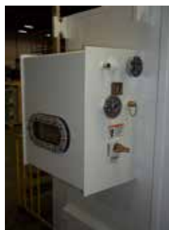
Figure 7. External visible break with gauges.