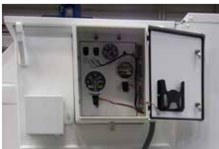
Figure 6. External Gauges.