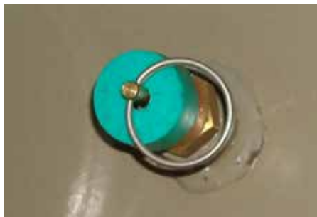
Figure 4. Automatic pressure relief valve.