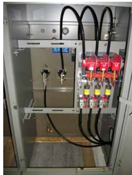
Figure 8. Modular transformer.

An MTU utilizes existing utility infrastructure, therefore eliminating the need to engineer and construct a dedicated communication network.