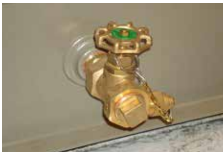
Figure 3. Drain valve with sampler.