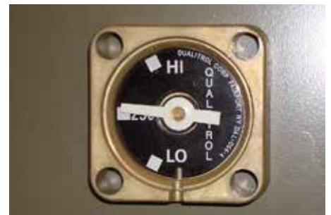
Figure 5. Liquid level gauge.