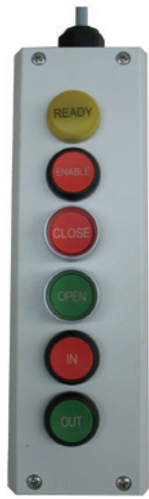
Figure 2. MRR1000 hand-held pendant