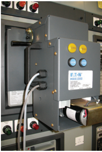
Figure 1. MRR1000 connected to Magnum DS breaker