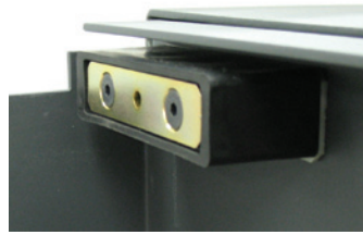
Figure 3. MRR1000 neoprene locking fixture