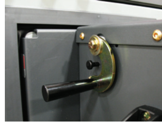
Figure 4. MRR1000 fixture locking handle