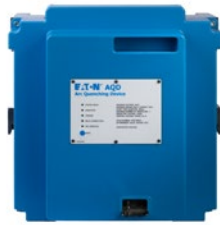
Arc Quenching Device