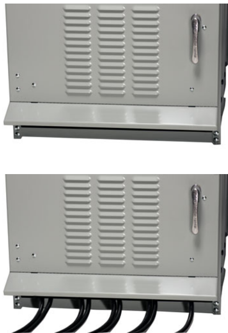
Bottom Door and Cables (Type 3R) The Hinged Cable Entry Trap Door Allows Cable Access to Both the Receptacles and Lugs, While Maintaining Type 3R Enclosure Integrity