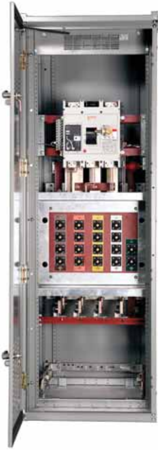
Typical Generator — Quick Connect Assembly (Internal View)