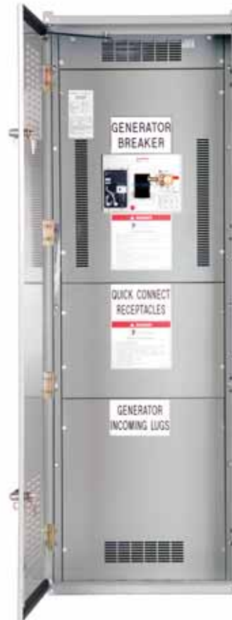
Typical Generator — Quick Connect Assembly (External View)

You cannot predict the future... but with Eaton's Generator Quick Connect Switchboard you can be prepared for the unexpected.