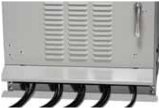
Bottom Flip Up Cover for Easy Access to Incoming Lugs or Cam Lock Receptacles