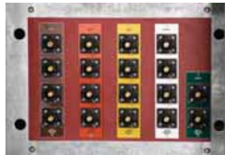
Cam Lock Receptacles with Color Coded Generator Connections

strikes, or other natural disasters, Eaton has a quick and easy solution for you. In conjunction with having a portable power supplier to provide a mobile, trailer-mounted generator delivered to your site, Eaton's Generator Quick Connect Switchboard is the answer to getting your facility back on line quickly.