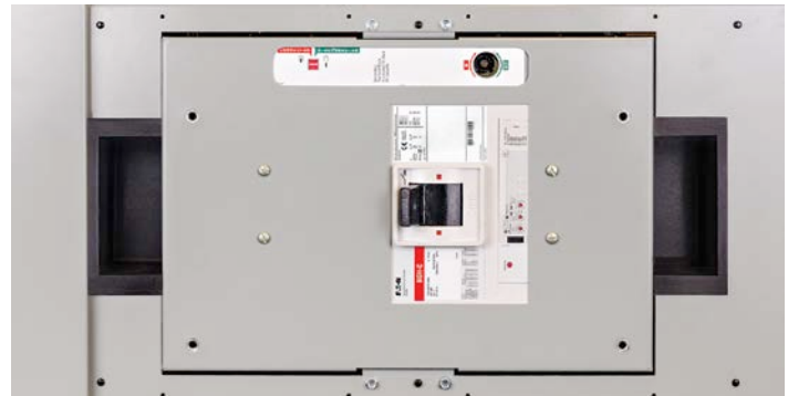
NG drawout molded-case circuit installed