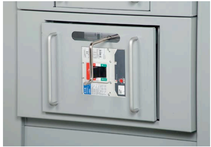
Drawout MCCB disconnected from bus

The JG and LG families of drawout breakers are available in either a single group-mounted design or a high-density, space-saving dual group-mounted design where two breakers occupy the same vertical space. The NG family of drawout breaker is available in a single group-mounted design.