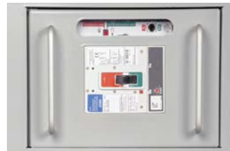
JG and LG drawout molded-case circuit installed