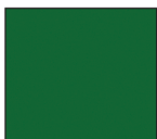
Safety Green OK5030WGN-P