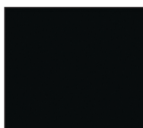
Black Texture MN4007