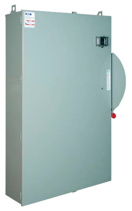
1200 A shunt trip switch with integrated ground fault relay and sensor

Eaton's tried and true heavy-duty safety switch line expands to include shunt trip capability—remote switching and visible means of disconnect for commercial and industrial applications.