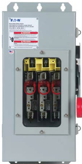
Eaton 30 A and 60 A heavy-duty safety switches feature a vertical viewing window.

Note: Kit includes window gasket, glass, frame, washers, acorn nuts and instruction drawing.