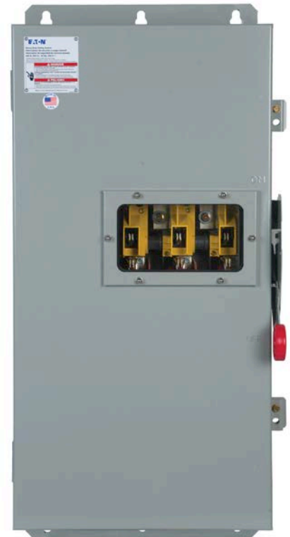
Eaton 200–800 A heavy-duty safety switches also feature a horizontal viewing window—while 1200 A models feature two, side-by-side horizontal windows.

For more information, please contact your local Eaton sales representative or visit