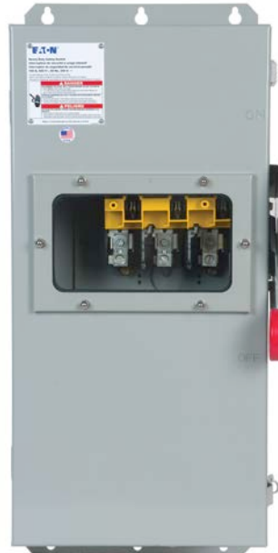
Eaton 100 A heavy-duty safety switches feature a horizontal viewing window.